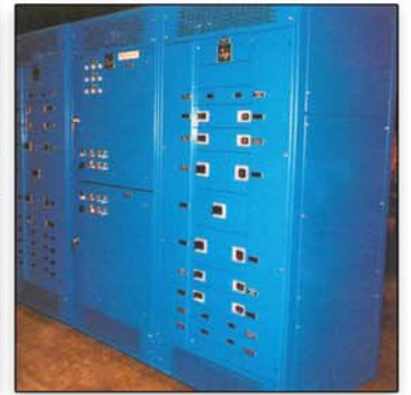
Low Voltage Metal-Enclosed Switchgear