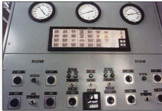
Custom Control Panel