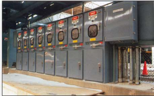
DC Switchgear Lineup Chicago Transit Authority

Our products are built to the highest standards of excellence and designed to perform under the most demanding conditions. You won't find more reliable equipment anywhere, and that is why engineers around the country are specifying our products in new transportation systems and on renovation projects.