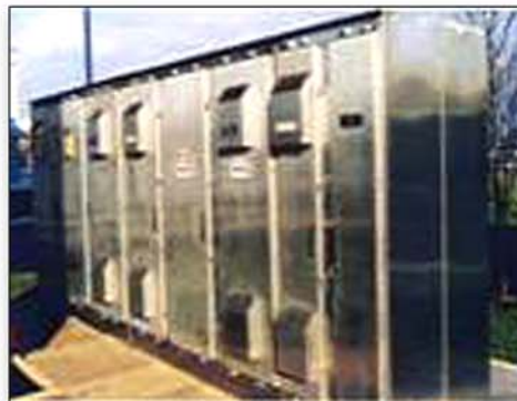
Switch Operator Control Cabinets for Newark Airport Monorail System