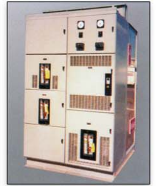
AC Switchboard for Power Substation